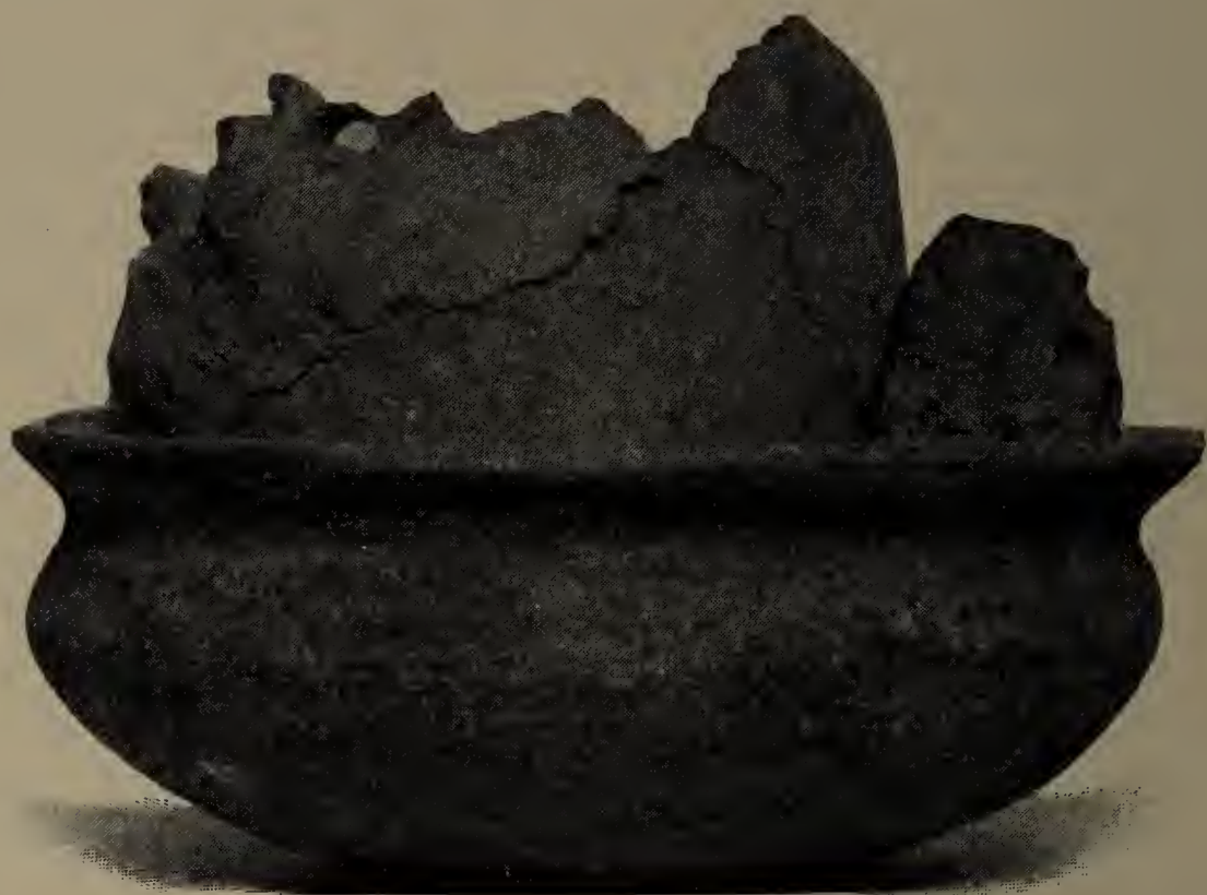
Fig. 1. Pottery Dish with Human Skull and Sculptured Stone.